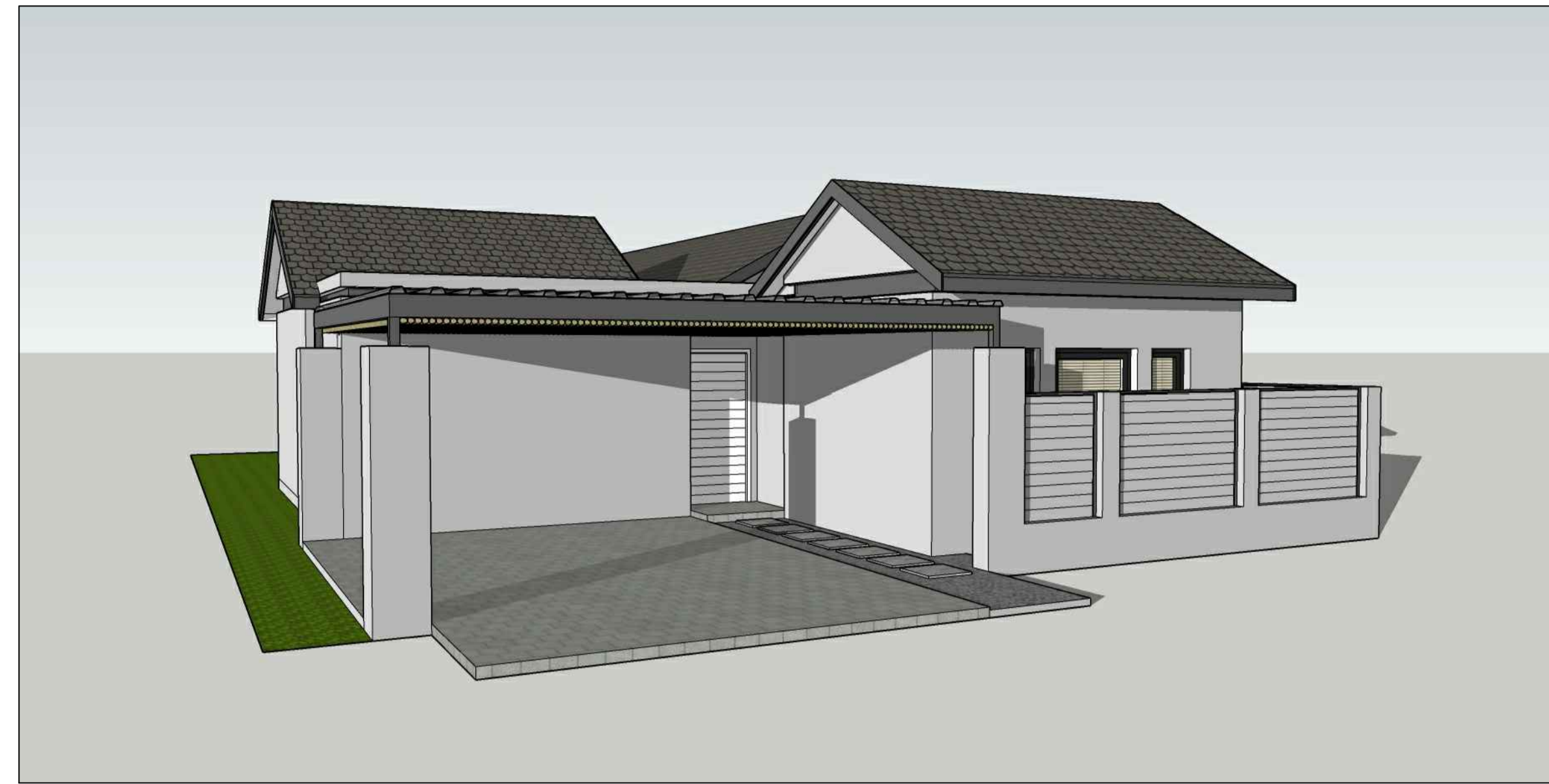
STREET ELEVATION - NORTH or SOUTH