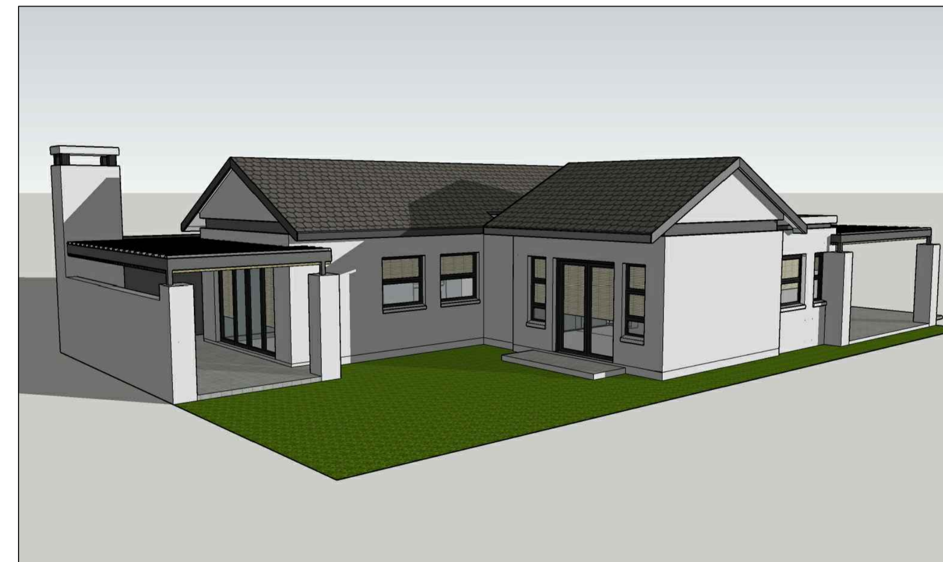
ELEVATION - EAST or WEST