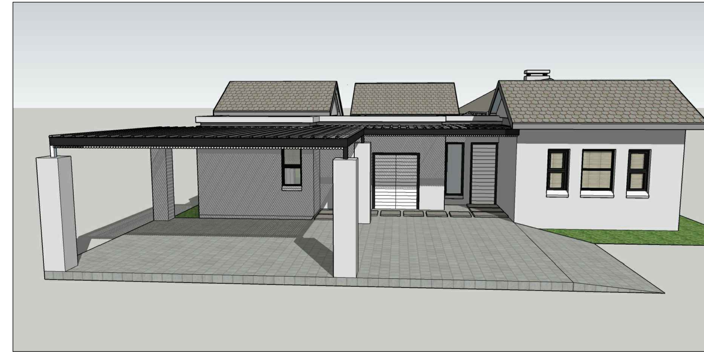
STREET ELEVATION - NORTH or SOUTH