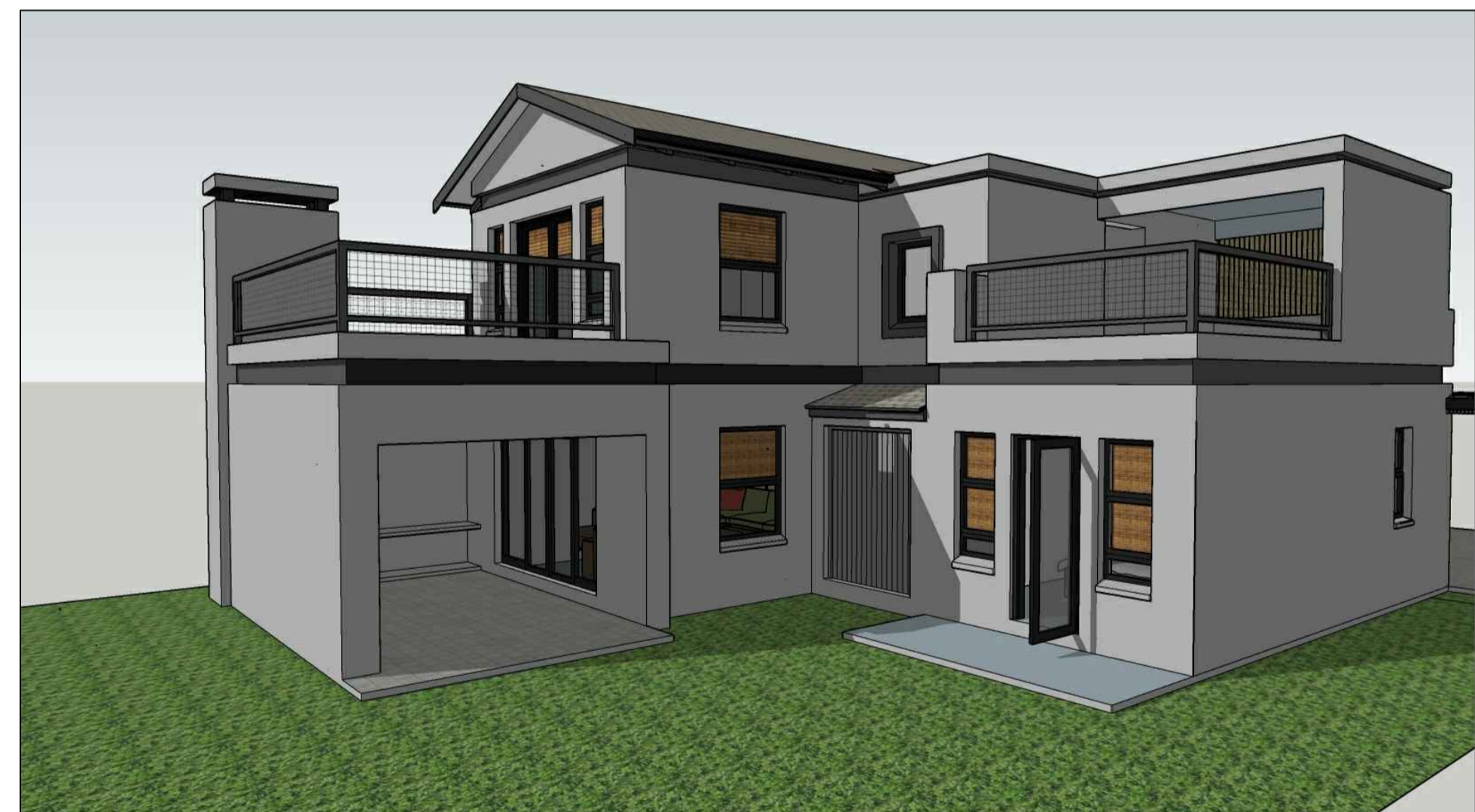
ELEVATION - NORTH or SOUTH