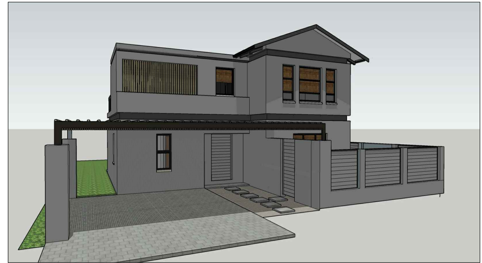
STREET ELEVATION - WEST and ENTRY