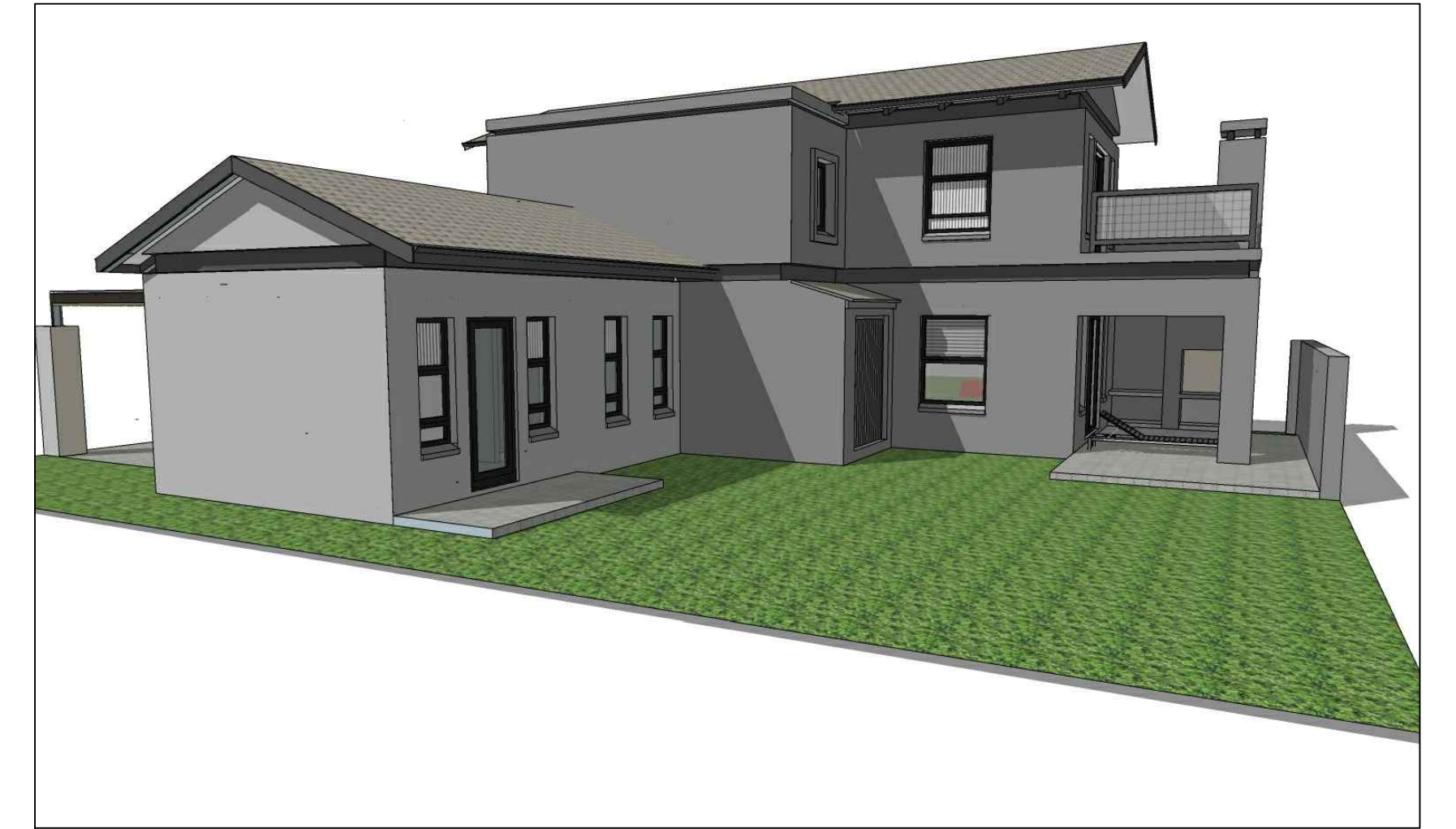
ELEVATION - EAST or WEST