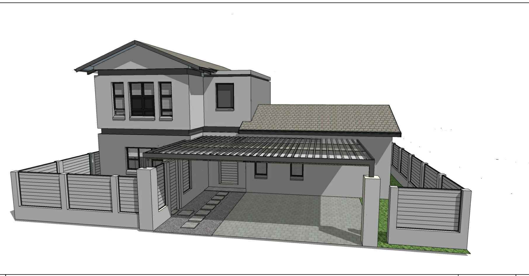
STREET ELEVATION - NORTH or SOUTH